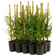
LIECO 15 LIECO 15