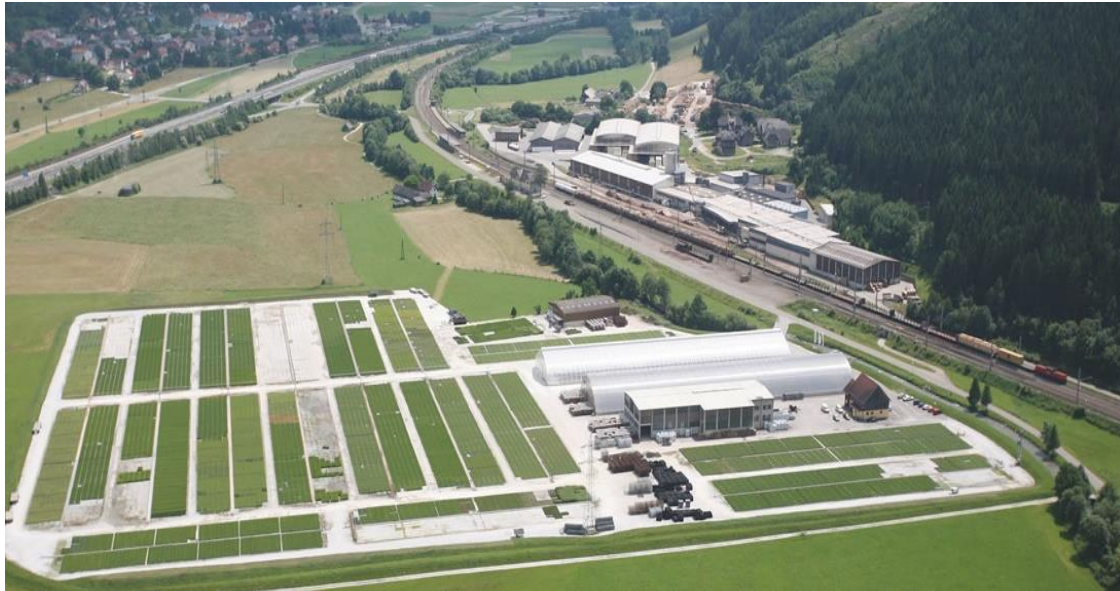
Production site Kalwang